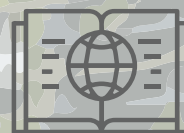
Chinese language course